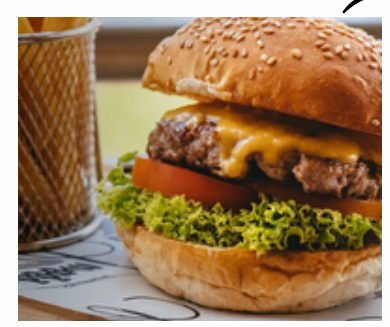
CHEESE BURGER R100 100G PURE BEEF PATTY WITH LETTUCE, TOMATO & CHEESE ON A BRIOCHE BUN