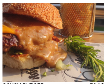
SAUCY BURGER R140 1 X 200G PURE BEEF PATTY WITH CHEESE, LETTUCE, TOMATO, GHERKINS. CHOOSE YOUR SAUCE.