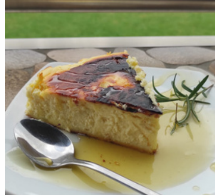
BURNT BASQUE CHEESECAKE R75 CREAMY BAKED GOODNESS WITH A HINT OF FRESH LEMON, DRIZZLED IN A WARM HONEY, LEMON & BUTTER SAUCE