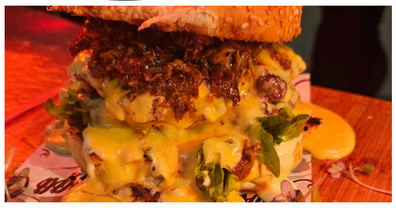
SWAGGA BURGER 2.0 R165 2 X 100G SMASHED BEEF PATTIES, 2 SLICES OF CHEESE. SMOTHERED IN CHEESE SAUCE TOPPED WITH BRISKET.