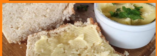
HOMEMADE BEER INFUSED MIELIE BREAD R25 2 X SLICES SERVED WITH BUTTER V