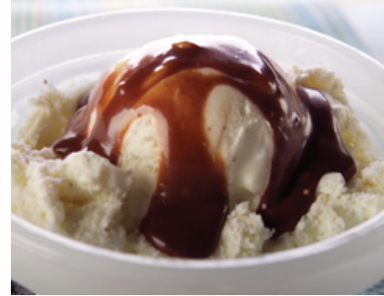
ICE CREAM & CHOCOLATE SAUCE R55 A DELICIOUS TWIST TO AN OLD FAVOURITE.

ASK YOUR WAITER ABOUT OUR CAKE OF THE DAY