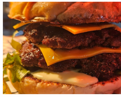
DOUBLE SMASH R125 2 X 100G PURE BEEF SMASHED PATTIES WITH CHEESE SERVED ON A BRIOCHE BUN