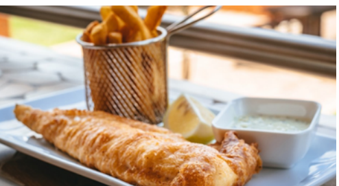
FISH & CHIPS R130 DEEP FRIED COUNTRY ALE BEER BATTERED FISH SERVED WITH CHIPS OR SALAD & TAR TAR SAUCE.