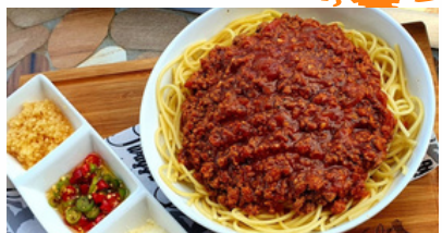
SPAGHETTI BOLOGNAISE R115 100% BEEF MINCE COOKED IN COUNTRY ALE BEER, TOMATO PUREE.