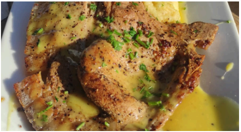
PORK LOIN CHOP R145 MARINATED IN SWAGGA COUNTRY ALE BEER, MUSTARD & HONEY GRILLED TO PERFECTION. SERVED WITH CREAMY MASH AND BUTTERY CABBAGE.