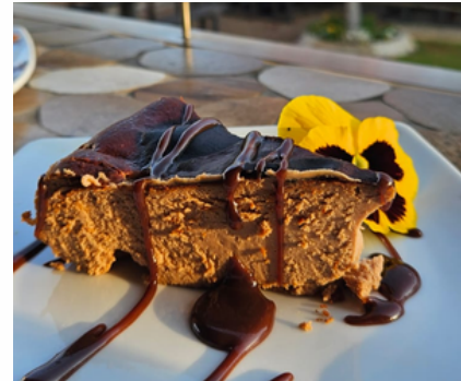
BURNT BASQUE NUTELLA CHEESECAKE R85 BURNT BASQUE NUTELLA CHEESECAKE SERVED WITH A NUTELLA GANACHE.