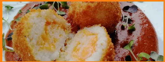
SWAGGA BOMBS V R70 COARSELY GROUND YELLOW MAIZE MEAL PAP BALLS FILLED WITH CHEDDAR CHEESE SERVED WITH A BASIL & TOMATO REDUCTION. ADD JALAPENO R10 ADD BACON R10