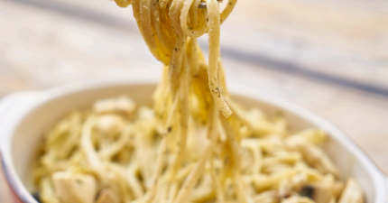
GARLIC PASTA V R100 SPAGHETTI SMOTHERED IN A FRESHLY CHOPPED GARLIC SAUCE