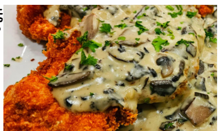
CHICKEN SCHNITZEL R150 DEEP FRIED PANKO CRUMBED CHICKEN FILLET SERVED WITH MASH OR CHIPS & ONION RINGS.