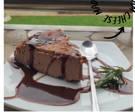
BURNT BASQUE BAR-ONE CHEESECAKE R80 RICH, CHOCOLATEY PERFECTION DRIZZLED IN DECADENT BAR-ONE GANACHE.