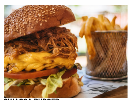
SWAGGA BURGER R130 100G PURE BEEF PATTY, TOMATO, LETTUCE, CHEESE CHOOSE PULLED PORK OR BRISKET