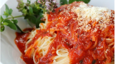
TOMATO & BASIL V R100 SPAGHETTI SMOTHERED IN TOMATO NAPOLETANA SAUCE TOPPED WITH BASIL