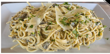
MUSHROOM ALFREDO V R100 SPAGHETTI WITH CREAMY MUSHROOM SAUCE ADD CHICKEN R15 ADD BACON R15