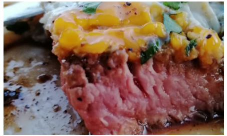
STEAK, EGG & CHIPS R150 250G RUMP TOPPED WITH A FREE RANGE EGG & SERVED WITH CRISPY CHIPS.