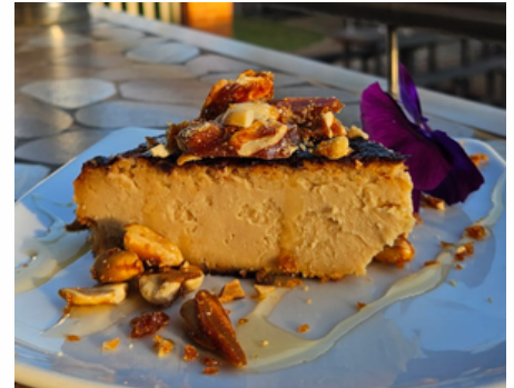
BURNT BASQUE PEANUT BUTTER CHEESECAKE R80 DRIZZLED WITH HONEY AND SERVED WITH OUR HOMEMADE PEANUT BRITTLE.