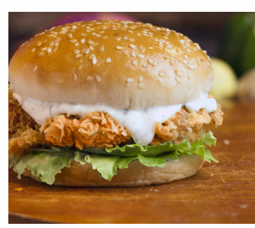
CHICKEN BURGER R100 GRILLED CHICKEN FILLET SERVED ON A BRIOCHE BUN