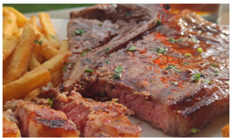
500G T-BONE R190 PAN-SEARED & BUTTER-BASTED IN SWAGGA COUNTRY ALE WITH GARLIC, ROSEMARY & THYME. SERVED WITH ONION RINGS & YOUR CHOICE OF STARCH OR SALAD.