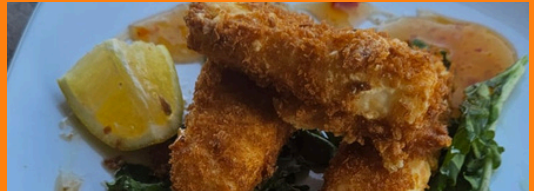
HALLOUMI V R75 FRIED HALLOUMI SERVED WITH ROCKET, SWEET CHILLI SAUCE AND A SLICE OF LEMON