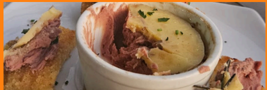
CHICKEN LIVER PATE R85 CHICKEN LIVERS FLAMBED IN BRANDY ENRICHED WITH CREAM & A HINT OF PERI-PERI SERVED WITH BEER INFUSED MIELIE BREAD