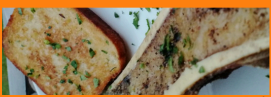
MARROW BONES R70 2 X MARROW BONES ROASTED TO PERFECTION SERVED WITH 2 X SLICES OF BEER INFUSED MIELIE BREAD