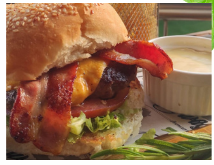
CHEESE & BACON R130 1 X 200G PURE BEEF SMASHED PATTY WITH HONEY GLAZED BACON ON A BRIOCHE BUN LETTUCE, GHERKIN, TOMATO